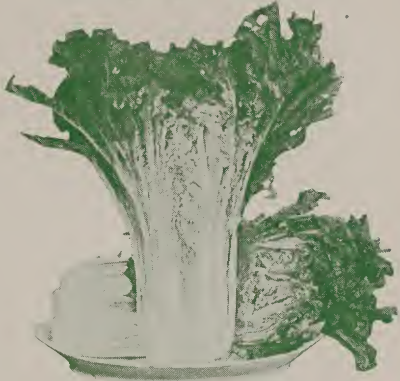
Chinese Cabbage—See Page 20

LONG ISLAND IMPROVED DWARF. This is an acclimated American type and will resist the changes of climate better than the European varieties. It is dwarf, with good sized sprouts almost round in shape. Pkt., 5c; oz., 30c; \frac{1}{4} lb., $1.00, 1 lb., $3.50.